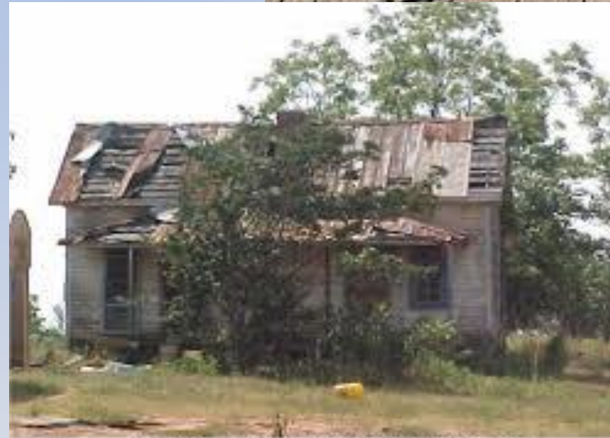
Photo: One of several poorhouses (or work houses) that were located next to the Kingsley house. Located on Pine House Rd., Clayton, Alabama.