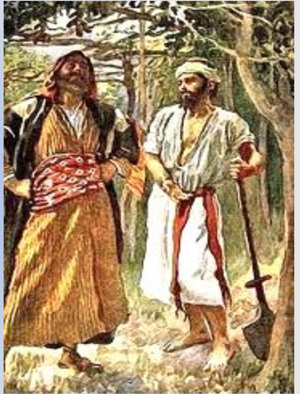
The parable of the Fig Tree by Harold Copping

6 Then he told this parable: “A man had a fig tree growing in his vineyard...”