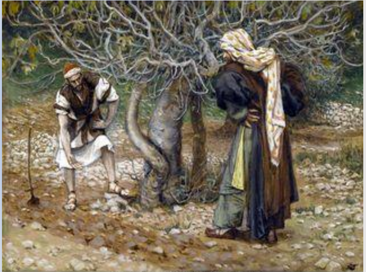
The Vine Dresser and the Fig Tree by James Tissot.

Jesus moves from present to eternal People will suffer and die but don't let yourself die forever!